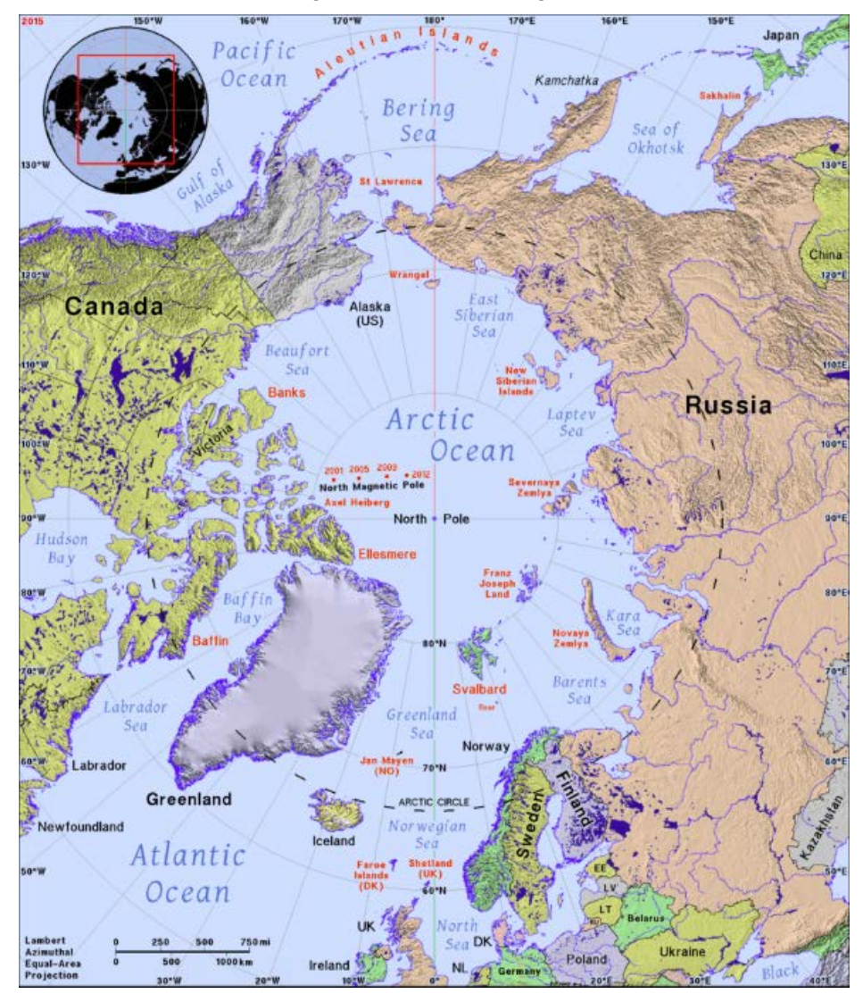
Figure 1. The Arctic Region