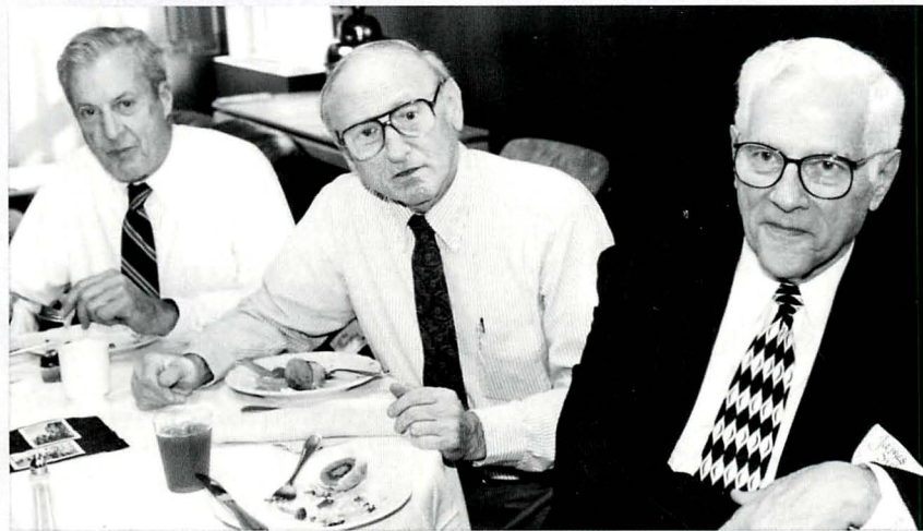
Members of the class of 1948 celebrate their forty-fifth reunion.