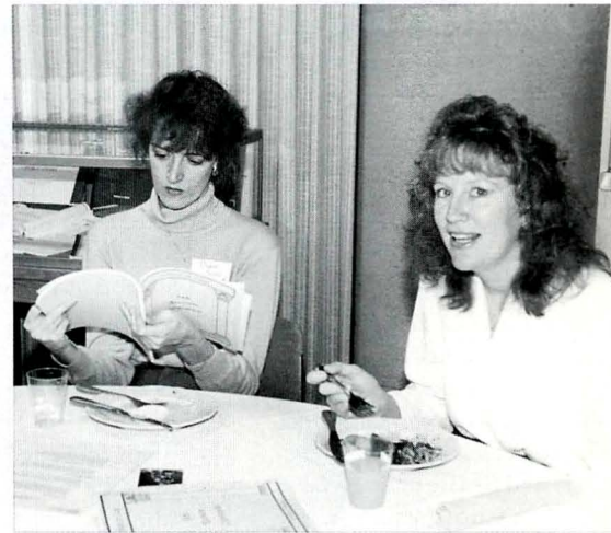
Members of the class of 1988 check out the reunion yearbook.