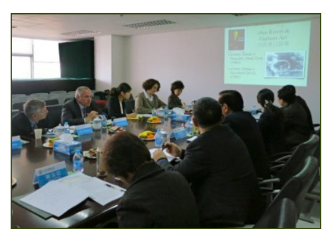
Prof. Percival speaks at All China Environment Federal Workshop

plants in the province create highly visible pollution, which shocked some of the members of the group, who had thought that the rare clear conditions in Beijing (caused by unusually high winds) indicated that China was making more progress in controlling pollution. On March 14 the group visited the site of the buried terra cotta warriors, which is located approximately an hour east of the city of X'ian. After a raucous night in a karaoke bar in X'ian, the group left at 5:30AM on March 15 for an early morning flight to Shanghai.