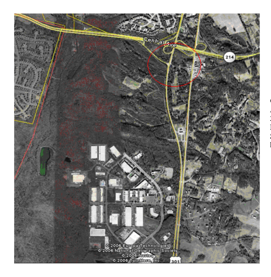
Collington Crossroads' 325 Acres at the SW Corner of 214 and 301 Remains Barren to this Day.

poor location. "If we had to do it again," he noted to the Washington Post, "we would have located it in another place."86 Even the local government acknowledged its failure to successfully develop Collington Center. County Executive, Parris Glendening, spoke of the industrial park as a disappointment by all assessments.<sup>87</sup> By the 1980's, the enthusiasm for the County's comprehensive plan that had carried so much weight in the Collington decision seemed to have vanished.