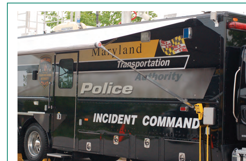
The MdTA Police's new emergency command vehicle was on hand at the "Command Truck Rally" on May 16, 2007.