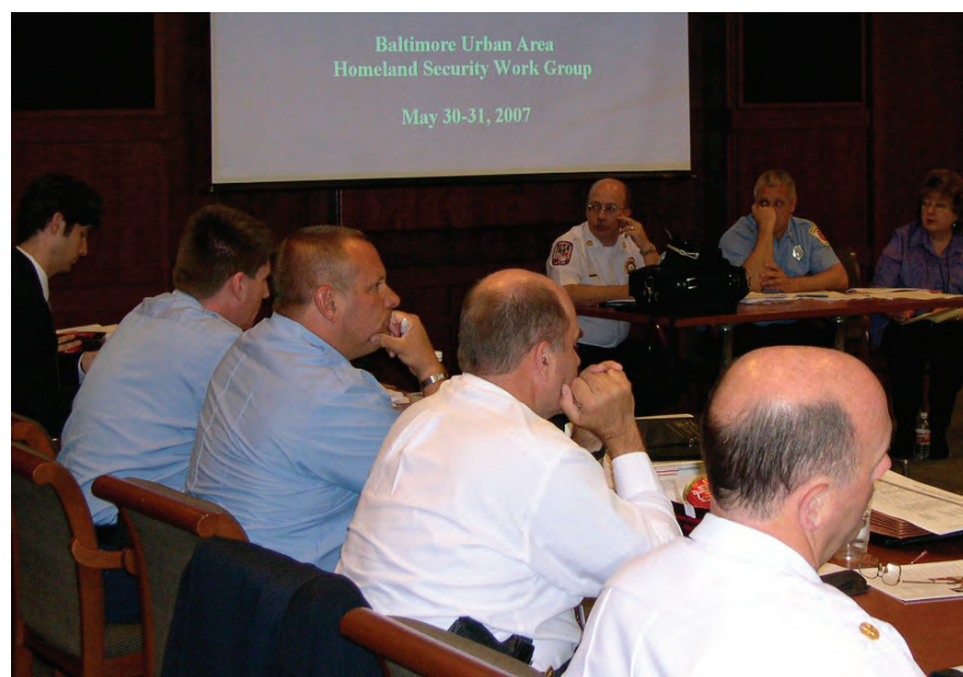
CHHS hosted the Baltimore Urban Area Workgroup at the University of Maryland School of Law for the group's monthly meeting.