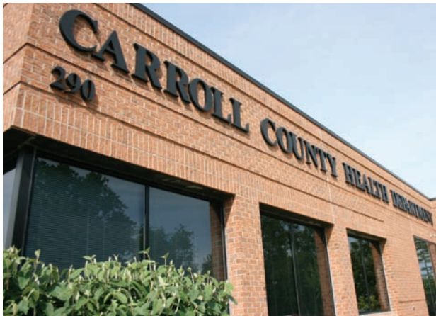
Headquarters of the Carroll County Health Department in Westminster, MD.

CHHS commenced Continuity of Operations (COOP) planning for the Carroll County Health Department (CCHD) in Westminster, MD in May 2008 with a CHHS-led kick-off presentation for CCHD senior staff.