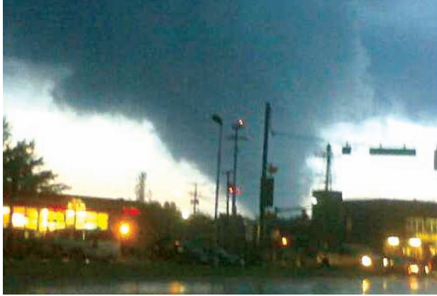
A tornado touches down in Anne Arundel County.