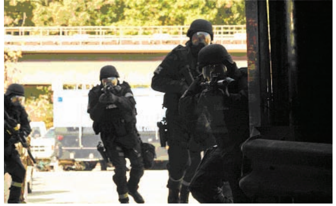
Action at the Anne Arundel County Office of Emergency Management fall exercise.

Anne Arundel County is subject to a variety of natural and man-made hazards due to its location on the Chesapeake Bay; its low lying coastal lands and waterfront homes; the presence of BWI airport; and the Maryland State capital within its boundaries. Recently, within a single month, there was severe flooding that resulted in the activation of the Emergency Operations Center (EOC) and a tornado that swept through the Arnold and Glen Burnie areas.