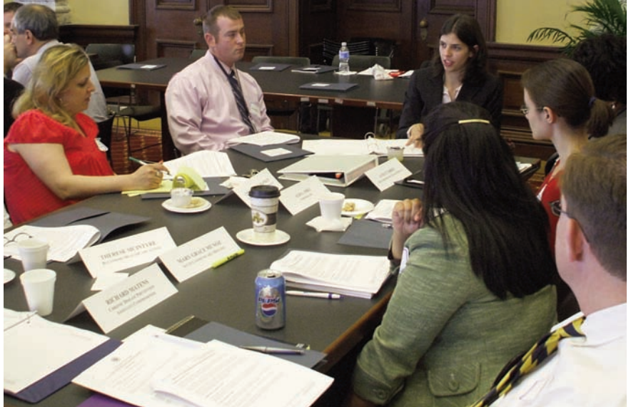
CHHS staffers join BCHD officials for a COOP tabletop exercise.