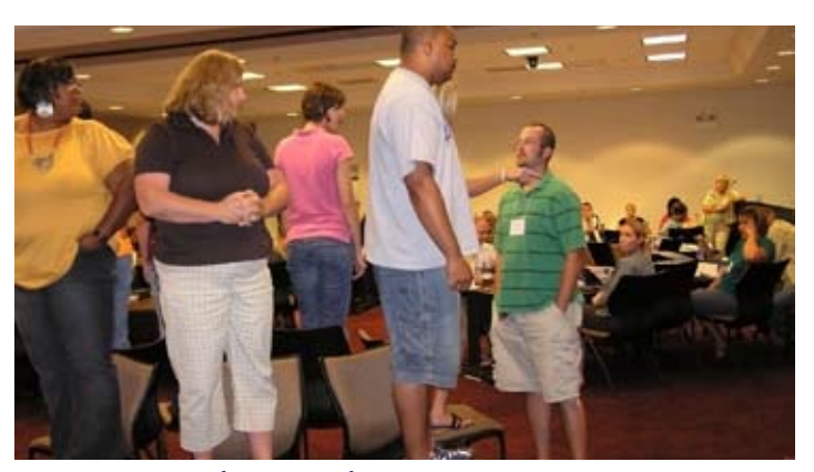
Educators at the training participate in a conflict management role playing exercise.

The summer training is part of the support offered to the schools participating in the Schools Conflict Resolution Grant Program. In its sixth year of operation, the grant program offers funds, training, curricular materials, and support from C-DRUM staff and Mediation Clinic students from the School of Law. Funded through a MACRO grant, the Schools Conflict Resolution Program is a collaborative partnership between C-DRUM, MSDE and MACRO.