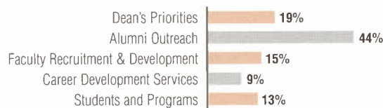
USES OF FUNDS IN FY '01