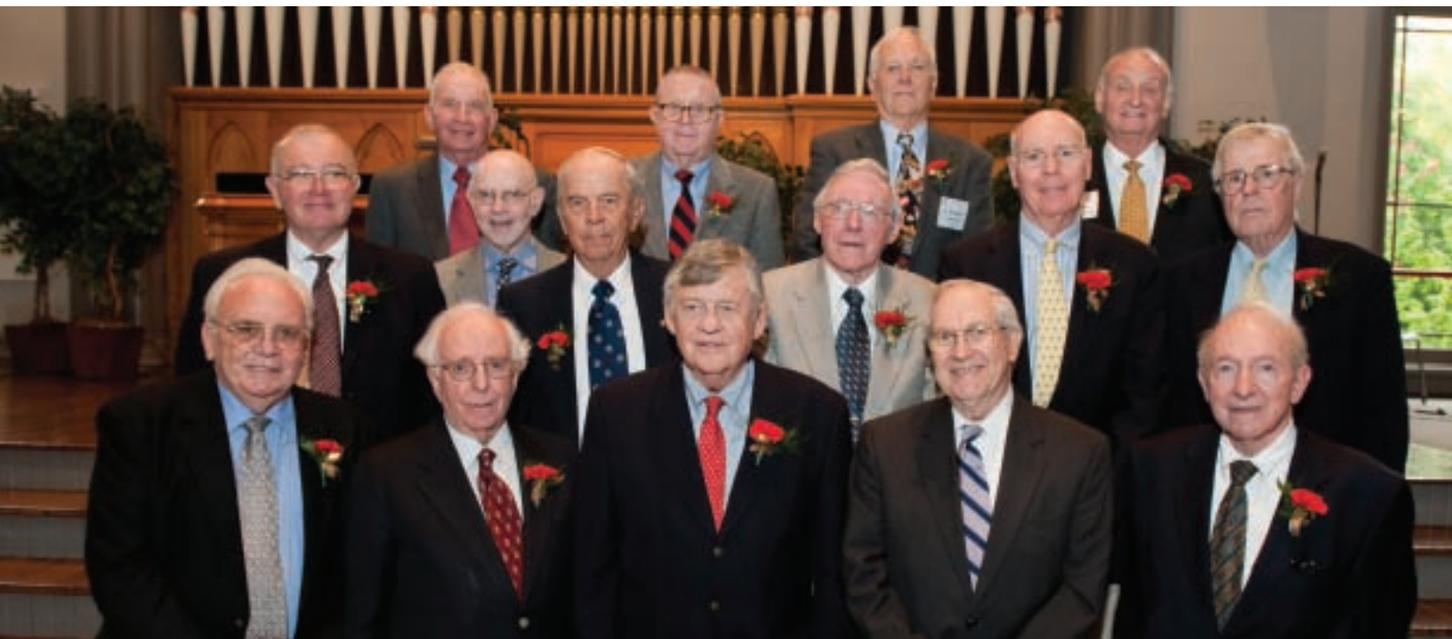
(above) Members of the Class of 1960