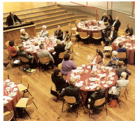
Faculty welcomed Justice Scalia at a reception in Westminster Hall.