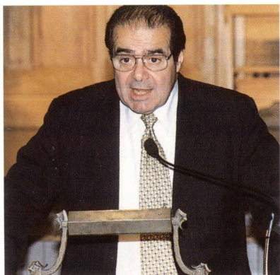
U.S. Supreme Court Justice Antonin Scalia spoke to a law school class in September.