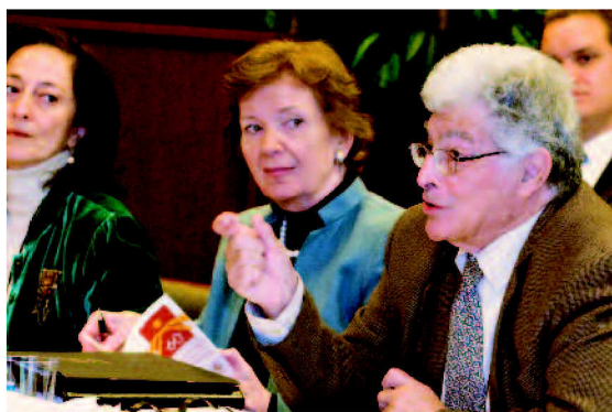
Justice Chaskalson (right) and Former President of Ireland and U.N High Commissioner for Human Rights Mary Robinson.

Former President of Ireland and U.N. High Commissioner for Human Rights Mary