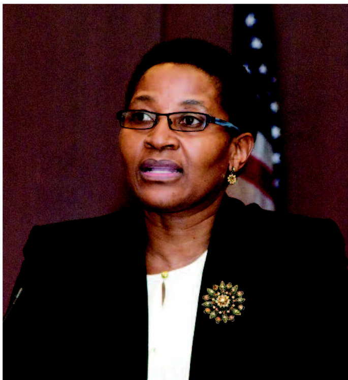
Distinguished Visiting Professor Justice Bess Nkabinde delivered the lecture "The Modern Constitution of South Africa: Are the Promises in the Constitution Realizable or a Distant Dream?"