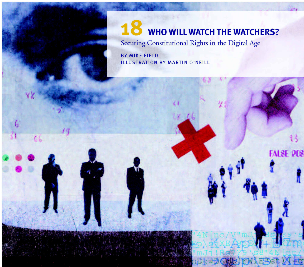
ILLUSTRATION BY MARTIN O'NEILL