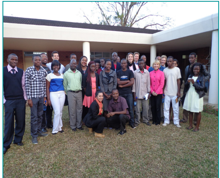
UMB Students and Faculty with Chancellor College Students and Faculty