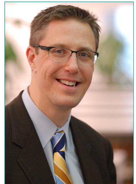
Professor Frank Pasquale

Health information technology can save lives, cut costs, and expand access to care. But its full promise will only be realized if policymakers broker a “grand bargain” between providers, patients, and administrative agencies. In exchange for subsidizing systems designed to protect intellectual property and secure personally identifiable information, key stakeholders should have full access to key data those systems collect. (Frank Pasquale 2012)