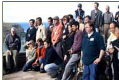
Participants at the 2005 Colloquium "Biodiversity Conservation, Law and Livelihoods: Bridging the North-South Divide," held in Sydney, Australia.