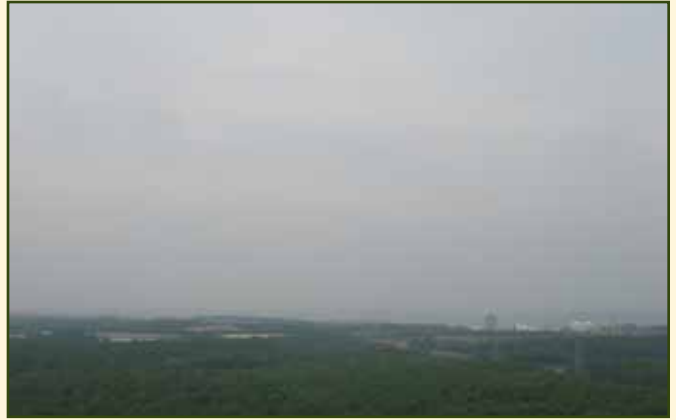
The smog problem: Baltimore on clear and hazy days. Ozone (which cannot be seen) is one of the pollutants that contributes to unhealthy air, usually in tandem with particulate matter (the haze seen above).