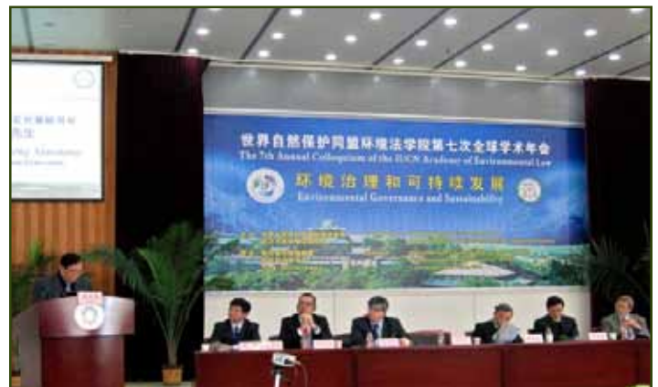
China Ministry of Environmental Protection General Counsel Bie Tao addressing the 2009 Colloquium of the IUCN Academy of Environmental in Wuhan, China

The theme of the 10th IUCN Academy Colloquium will be "Global Environmental Law at a Crossroads." The timing of the conference will be particularly propitious because it will be held just one month after world leaders gather in Rio in June 2012 for the "Rio+20" Earth Summit. The Colloquium will examine the path forward for the development of global environmental law and governance,