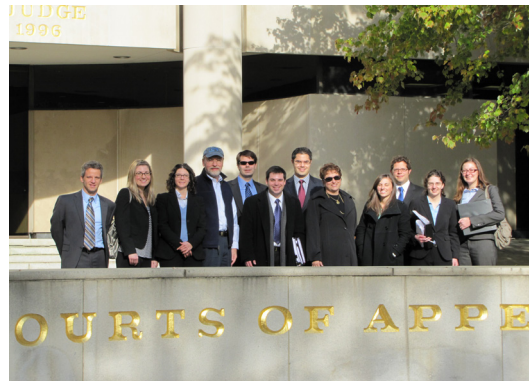
Environmental Law Clinic and their Clients at the Maryland Court of Appeals for the Environmental Integrity Project et al. v. Mirant Ash Management, LLC, et al. appeal