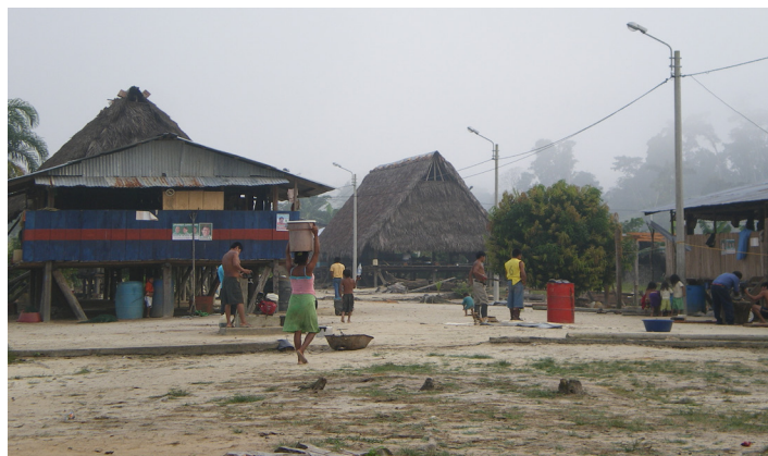
The Achuar community of Antioquia

After the case was removed to federal court, in 2008 the United States District Court for the District of California dismissed the case on forum non conveniens grounds without placing any conditions on the dismissal. The Court held that the case should be tried in Peru because it is a more convenient forum than the U.S. On appeal this past December, the Ninth Circuit reversed the dismissal and ruled that the case should proceed in Los Angeles and should not be tried in Peru. According to the Ninth Circuit, the trial court did not give enough deference to the strong presumption