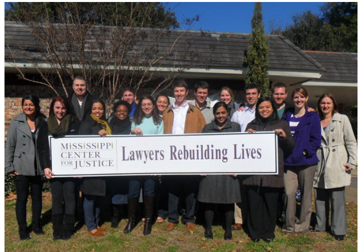
Students from the University of Maryland School of Law and Touro School of Law at the Mississippi Center for Justice.

The MCJ's goal is to educate the Gulfport community about the proposed construction and what Gulfport will look like once the project is completed. In the coming months there will be public hearings hosted by the Army Corps of Engineers and the companies building the port to hear any public comments on the project. The MCJ is working to include as many community members as possible to attend these meetings to ask tough questions concerning the effects port expansion will have on their families' health and quality of life. University of Maryland students assisted the MCJ by working to create informative presentations that were shown to local community groups. Maryland students also met with a group of local middle