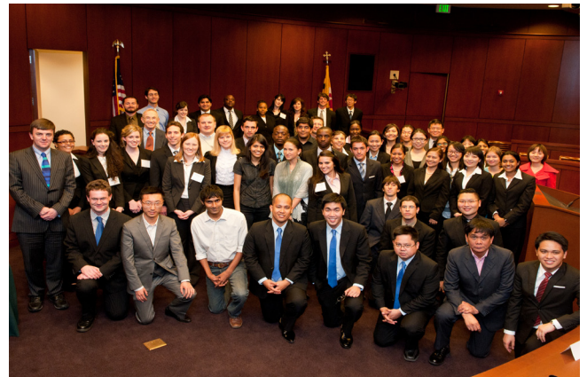
The 15th Annual Stetson International Moot Court Competition participants

During the preliminary rounds each team had four appellate arguments, which were held on Friday March 18 and Saturday March 19. On Friday evening, all participants in the competition were honored at the law school's third an-