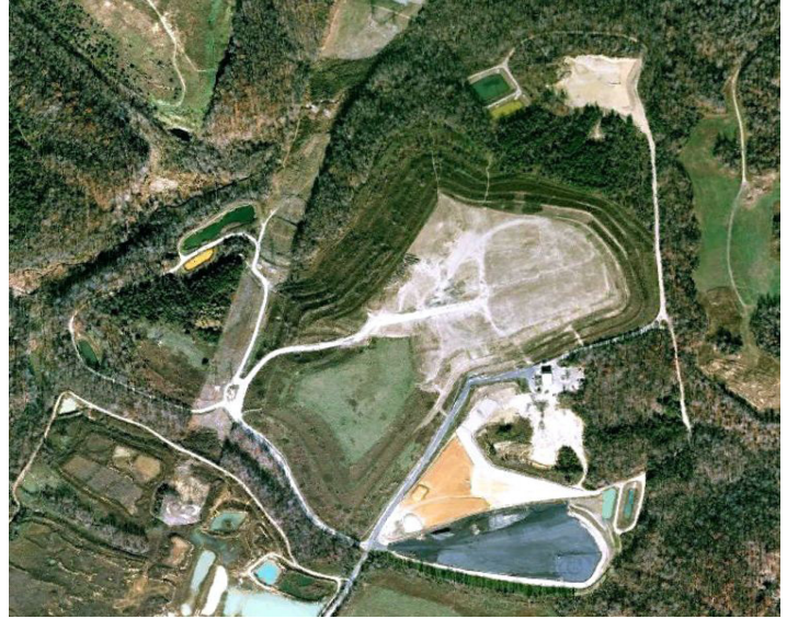
October 2008 aerial photograph of the Brandywine ash landfill in Prince George's County, Maryland

Mirant has used numerous disposal pits at the Brandywine landfill for coal ash disposal since 1970. Most of the pits that received coal ash are unlined, thereby allegedly allowing hazardous pollutants to leech out and contaminate ground and surface waters in the Patuxent River watershed. The Clinic's clients also allege that Mirant illegally discharged pollutants from outfalls into Mataponi Creek, a tributary of the Patuxent River, due to the poorly construct-